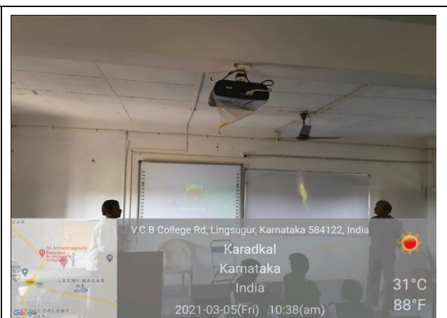
ICT Enable Class Room 11