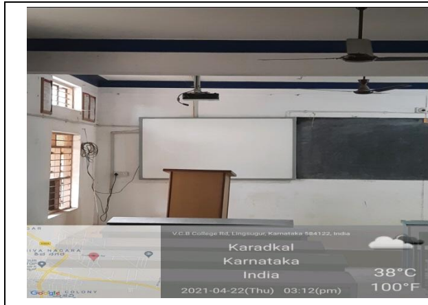
ICT Enable Class Room 1