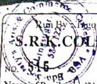
Figure Memorial Education Association